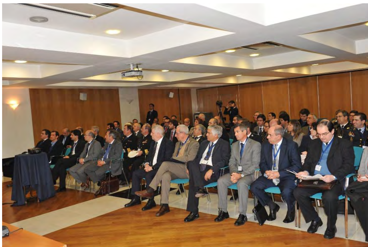
General view of the attendants of the workshop