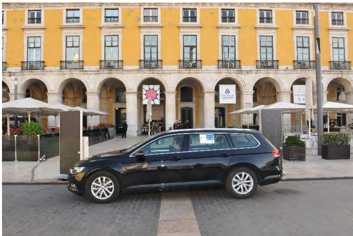
View of the demonstration car parked in front of MAI (Ministry of Internal Administration)